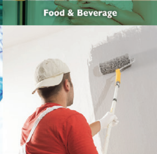
Paints & Coatings