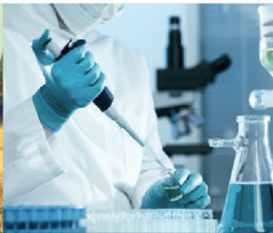
Specialty & Bulk Chemicals