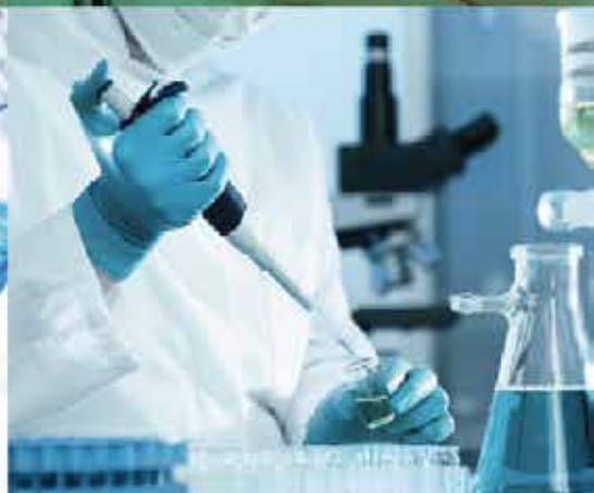
Specialty & Bulk Chemicals